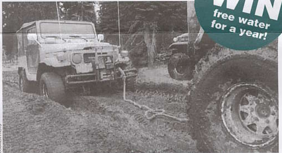
Because of the environmental damage caused by careless off-roaders, all motorized vehicles except snowmobiles will be banned from the Graystokes Plateau starting July 1st.

Not so, according to BMID administrator, Phil Ruskowsky. "Our watersheds are experiencing increasing pressures from