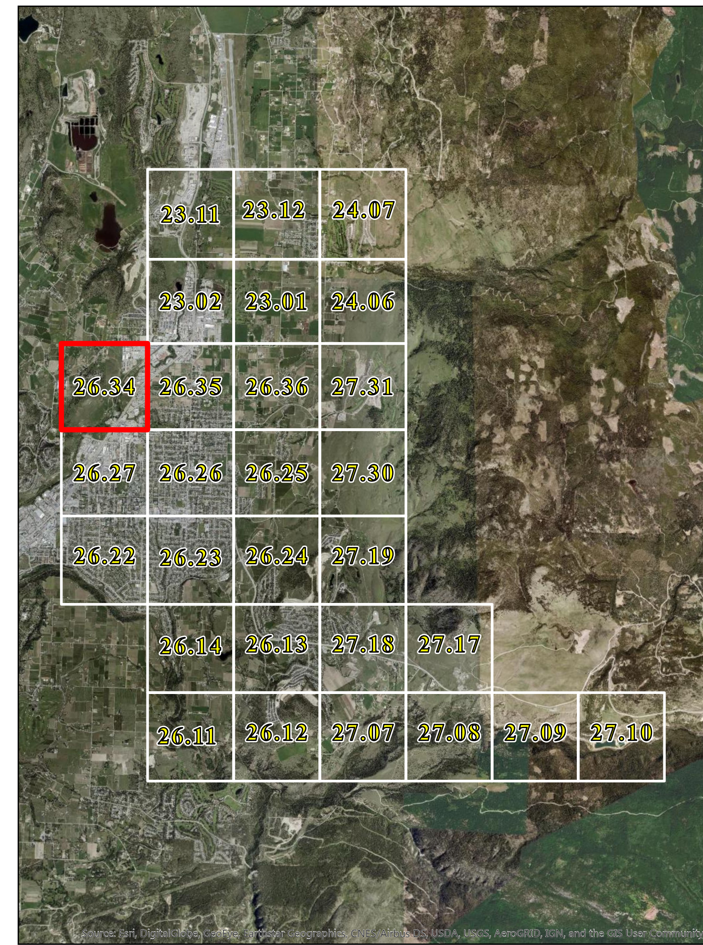
Key Map 0 1 2 3 4 Kilometres