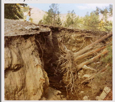
Supply Conduit major wash-out of 1973

As time continues to march on, BMID is very interested in collecting photos, stories from persons involved with the district, and information on relevant historical events that have occurred during the last 90 years.